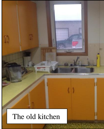
The old kitchen