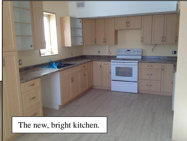
The new, bright kitchen.

When we began the renovations in 2016, we inadvertently opened a Pandora's box. The original, simple plan of renovating the kitchen and the basement exposed problems that made an upgrade of the entire building necessary: