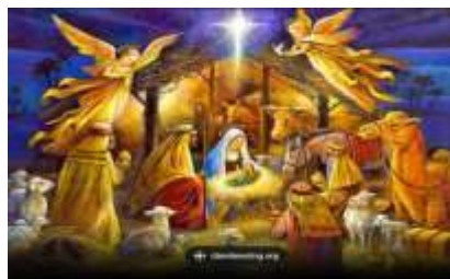
January 06: The Epiphany of the Lord

To All Our Beloved Parishioners Brothers and Sisters in Christ Sacred Heart Parish and Diocese of Whitehorse