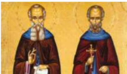
January 02: St. Basil The Great and St. Gregory Nazianzen