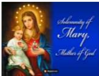
January 01: Solemnity of Mary, The Mother of God

The feast of the saints is important because it is a way of honouring God and growing in our love for Him 12 . It also reminds us of the ways the Lord has been and continues to be at work in the world 2 , and of the triumph of the Gospel 3 . By celebrating the feast days of saints, we commemorate their lives, their virtues, and their intercession for us. (EWTN)