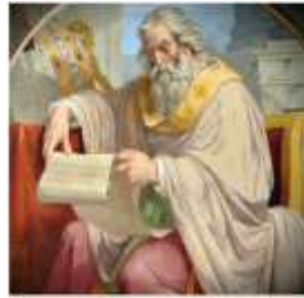
SAINT AMBROSE - DECEMBER - BISHOP AND DOCTOR OF THE CHURCH

Bishop and Patron Saint of Children, unmarried people, falsely accused, fishermen and pawnbrokers.