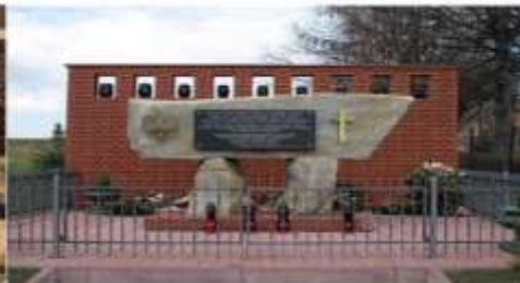
An inscription of the stone monument during the 60 th Anniversary of the Execution:

"Saving the lives of others they laid down their own lives. Hiding eight elder brothers in faith, they were killed with them. May their sacrifice be a call for respect and love to every human being! They were the sons and daughters of this land; they will remain in our hearts."